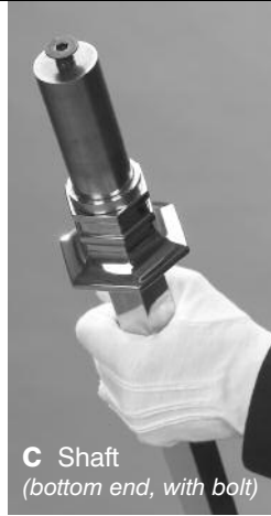
C Shaft (bottom end, with bolt)