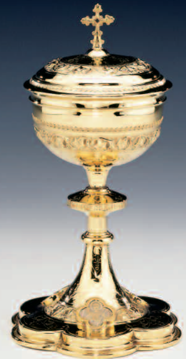
From: Immaculate Conception Church Guayanilla, PR