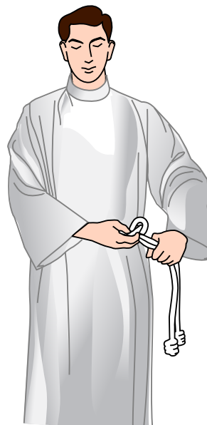
Drop loop and then tighten around waist