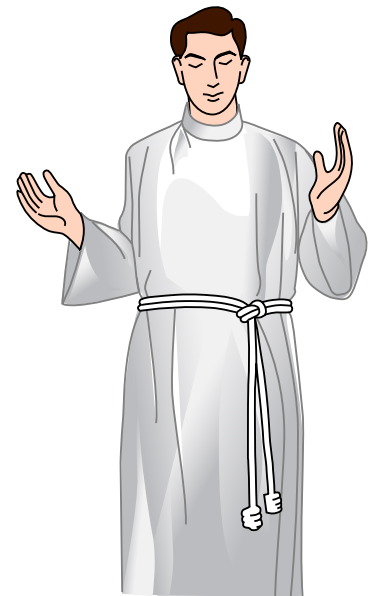
Knot is on left hip