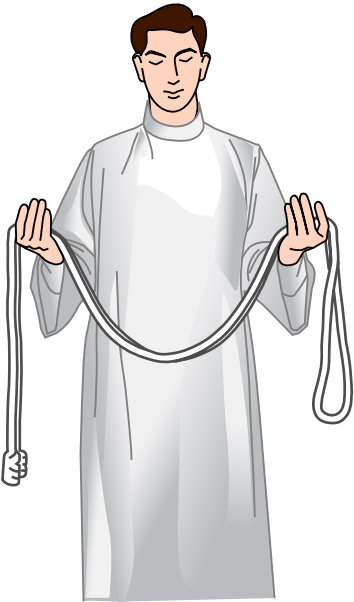
Fold cincture in half