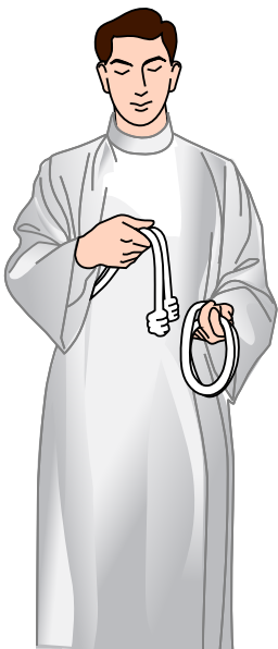
Grab knotted end with your right hand