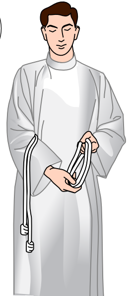
Using right hand, slip loop over left hand, keeping hold of cincture