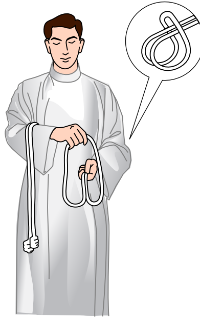
Grab end of loop made by the fold and overlap as shown