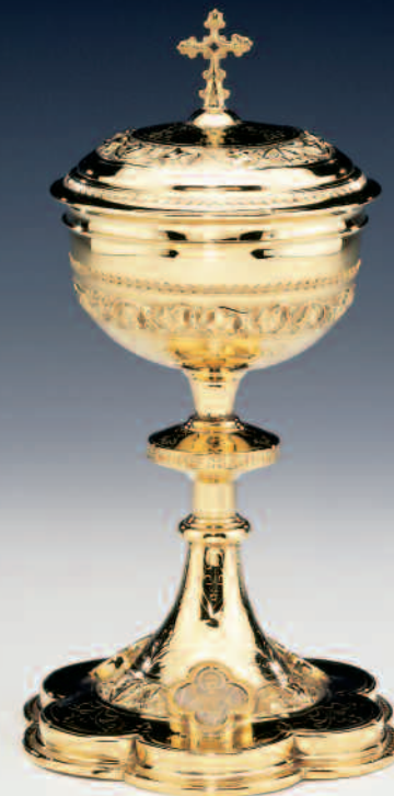
From: Immaculate Conception Church Guayanilla, PR